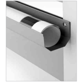
Front tray for prints (optional)