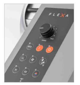
Control panel for adjusting temperature, speed and many more parameters